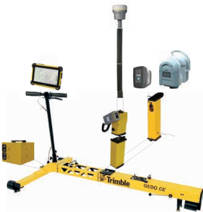
Specifications subject to change without notice.

Operating system ..... Microsoft Windows® 7 Professional Operation ..... Touchscreen Interfaces ..... HDMI, USB 2.0, Bluetooth® 4.0, WLAN(b/g/h) Environmental Protection ..... IP65; MIL-STD-810G Temperature range ..... -30 °C to +60 °C Weight ..... 1.4 kg